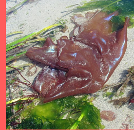
Mazaella splendens , Irridescent Weed

Brown family. Fronds can get 4 mm wide, 30 cm long. Disc-like holdfast. Dichotomous branching. Ends of the frond are rounded and may be swollen. Midrib usually present.