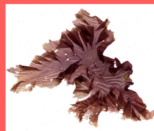
Pyropia perforata , Nori

Red family. Appears as a small, densely packed red bush or carpet. Usually 4-8 cm thick. Common as an undercanopy species on top of rocks. Invasive.