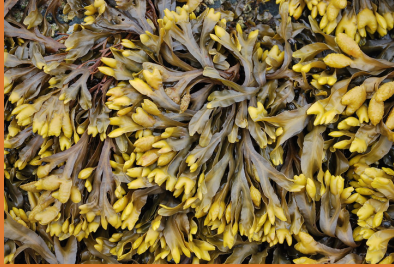
Fucus distichus , Rockweed

Brown family. Fronds can get 4 mm wide, 30 cm long. Disc-like holdfast. Dichotomous branching. Ends of the frond are rounded and may be swollen. Midrib usually present.