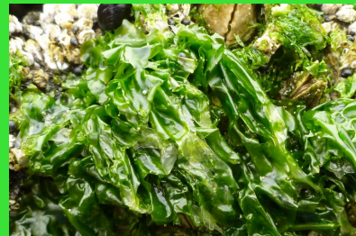
Ulva spp., Sea Lettuce

Green family. Multiple species in area require genetic testing to identify. Thin, cellophane like thallus. May grow to cover entire rocks or beds. Very common.