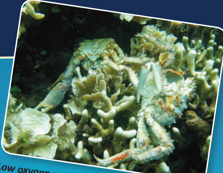
Low oxygen caused the death of these corals and crabs in Panama.

"Approximately half of the oxygen on Earth comes from the ocean," said Vladimir Ryabinin, executive secretary of the Intergovernmental Oceanographic Commission that formed the GO<sub>2</sub>NE group. "However, combined effects of nutrient loading and climate change are greatly increasing the number and size of 'dead zones' in the open ocean and coastal waters, where oxygen is too low to support most marine life."