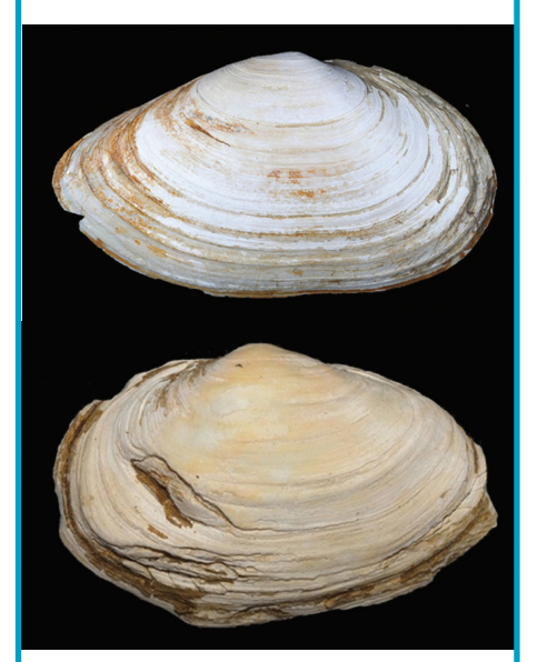
Soft-shell clams. Top: Mya arenaria. Bottom: Mya japonica.

For over a century, soft-shell clams have been unwitting identity crisis victims. Take two varieties: Mya arenaria , found in Europe and both U.S. coasts, and their Asian counterparts, Mya japonica . It's extremely difficult to tell them apart by sight. Many concluded they were one species.