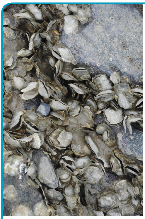
Olympia Oysters.

injection of extra freshwater—pushed settlement downstream. The discovery gives managers a shot at restoring the long-imperiled oysters. If they can keep an eye on conditions in winter and early spring, it could help them decide what time is "just right" to plant new oyster reefs for the baby larvae to settle on.