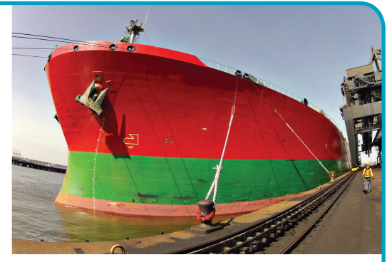
Ship Hull.

Most oceangoing ships carry unwanted hitchhikers: creatures like mussels, barnacles and bryozoans that latch onto their hulls and get ferried to other countries or continents. If conditions are right, some of those creatures take root in their new homes as invasive