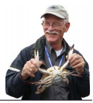
THE DIRECTOR'S LETTER