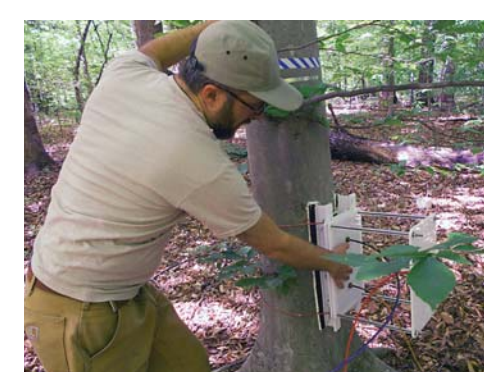
SERC postdoc Paul Brewer attaches methanemonitoring equipment to a tree.

The short answer is, no one really knows. Megonigal has some ideas: It's possible microbes and fungi living in and on the trees are to blame. Or it might be methane