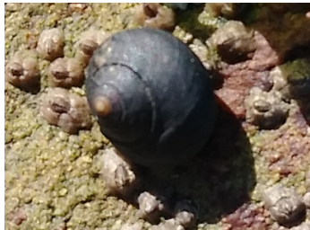
Black turban snail