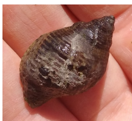
Eastern mud snail

Other organisms we are counting that you might find under Fucus: