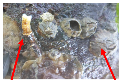
Tube worm and barnacles