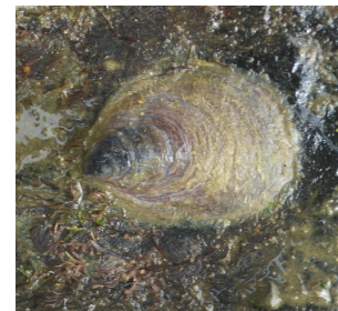
Slipper limpet (note the smooth, even edge)